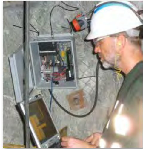
Evaluating wireless link performance.