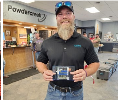
(1 ST Place Individual)