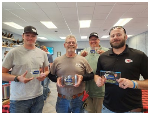
(1 ST Place Team)

The Sunflower Safety Council recently held its Fall sporting clay shoot benefit in Olathe, Kansas. Members participated in the morning's competitive clay shoot fundraiser for the council's scholarship fund. A huge thanks to all council committee/members who assisted and participated in the event.