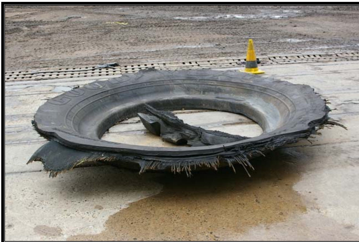
Figure 3: Tyre side wall from position number 1