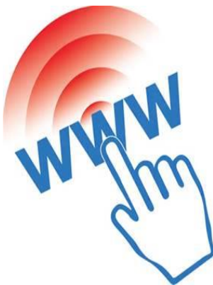
Paulisha Holt, Alabama Chapter Web Site