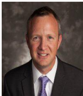
Troy Ogden Program Committee