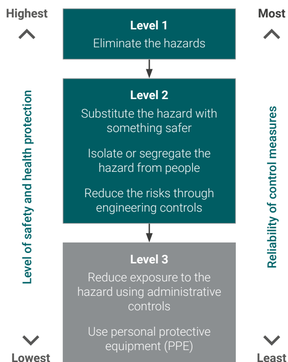
Figure 2 Hierarchy of control

The following is an example of the application of the hierarchy of control to address risks associated with chlorine on site: