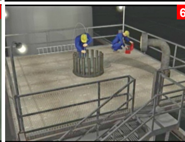
Pictures from US Chemical Safety Board Video - http://www.csb.gov/videos/hazards-of-nitrogen-asphyxiation/

A contractor maintenance crew was preparing to install a section of pipe at the top of a vessel in an oil refinery (1,2). A work permit (3) was issued for the job, with the expectation that no confined space entry was required. The scope of work was only to install the pipe section. The permit indicated that “Nitrogen Purge or Inerted” was N/A (Not Applicable) although the vessel was being purged with nitrogen (4).