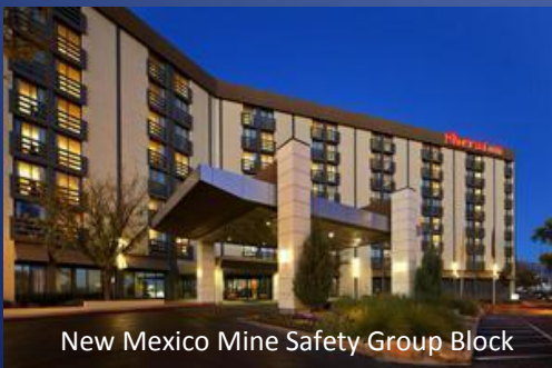
New Mexico Mine Safety Group Block

Sheraton Albuquerque Uptown 2600 Louisiana Blvd, NE Albuquerque, NM 87110 844-395-9645