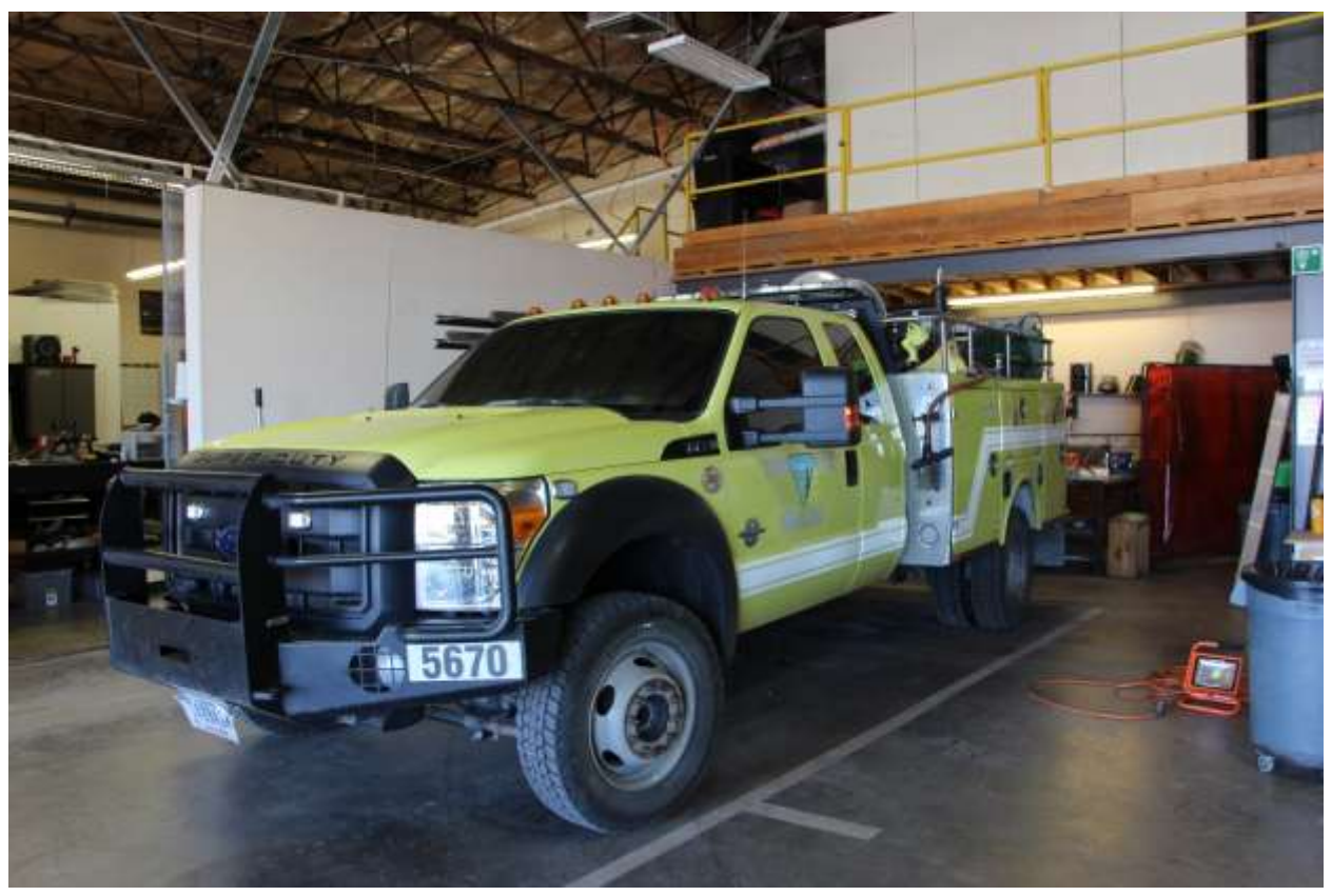
Undamaged exterior of fire engine.