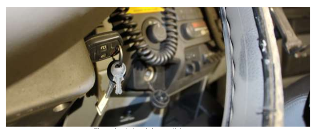
The engine dash and cigarette lighter component.