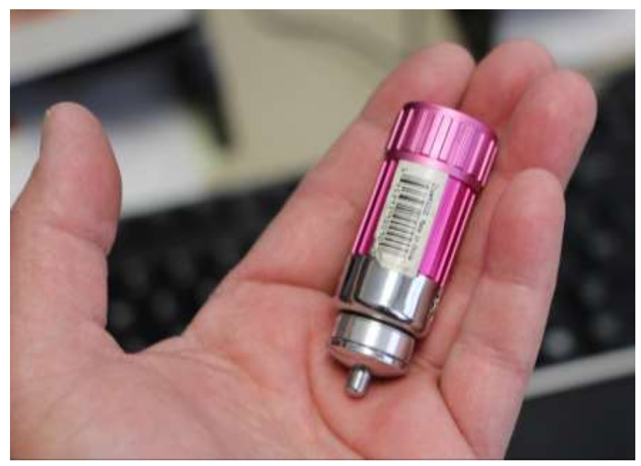
A small rechargeable flashlight like the pictured above caused the fire.

All considered, it was a very small fire and could have been far worse. One primary factor helped mitigate the potential damage: the rolled up windows on the cab of the engine.