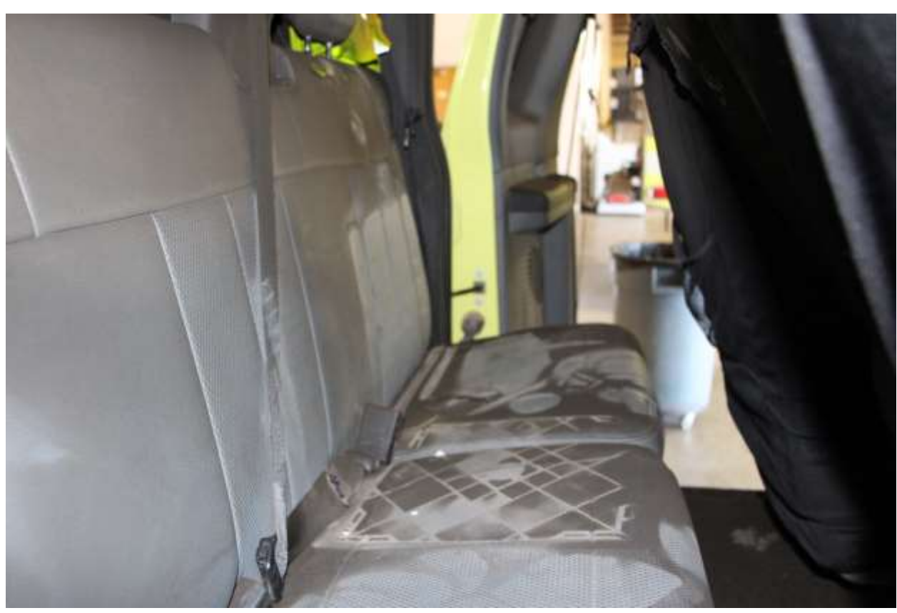
Smoke damage to back seat of cab.