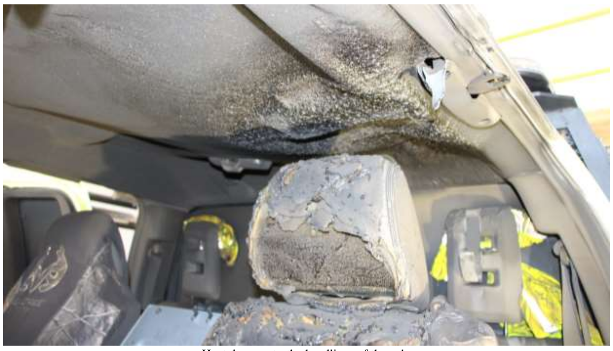
Heat damage to the headliner of the cab.