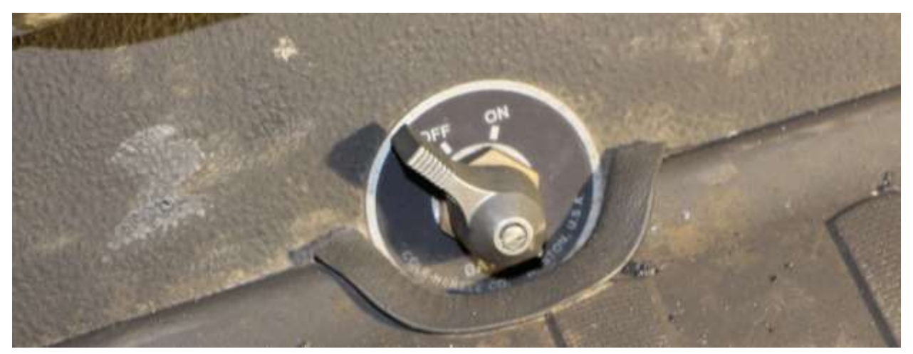
The engine power switch in the "off" position.