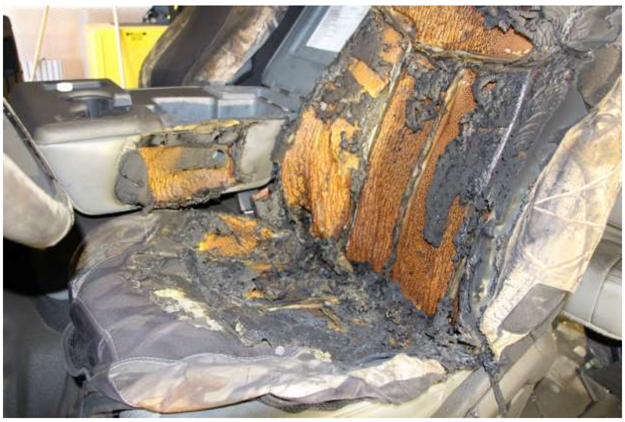
Fire damage to the driver's seat of the vehicle.