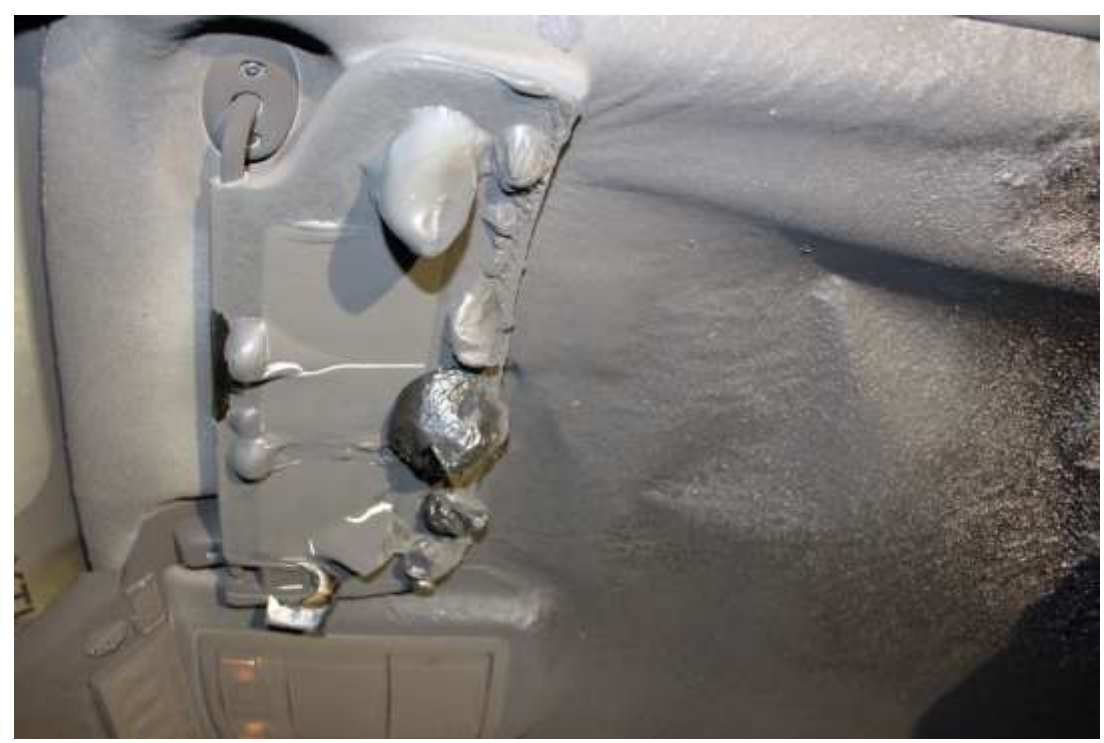
Head damage to driver's visor components.